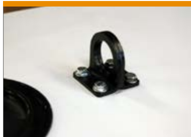
LIFTING HOOK GANCIO DI SOLLEVAMENTO