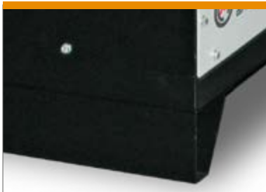
SELF SUPPORTING FRAME TELAIO AUTOPORTANTE